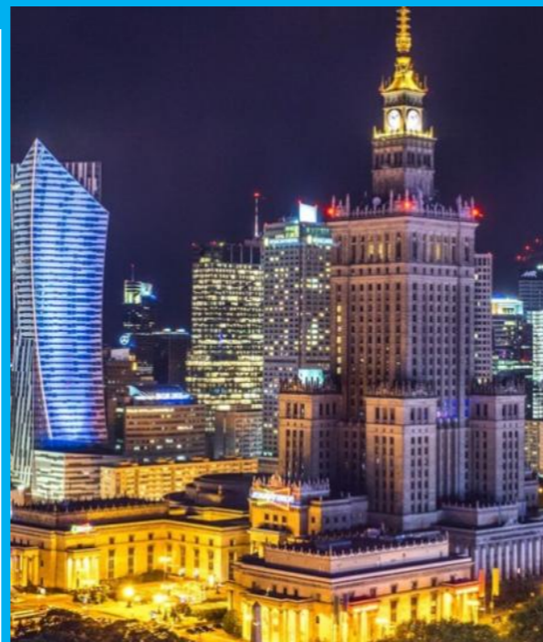
Famous places to visit—Warsaw and Tatra Mountains