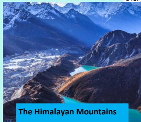
The Himalayan Mountains

The Taj Mahal in Agra was built by an emperor in the 1600s as the final resting place of his favourite wife. It remains the jewel of Muslim art in India. It is a Muslim tomb, not a Hindu temple and it receives around 7 million visitors every year.