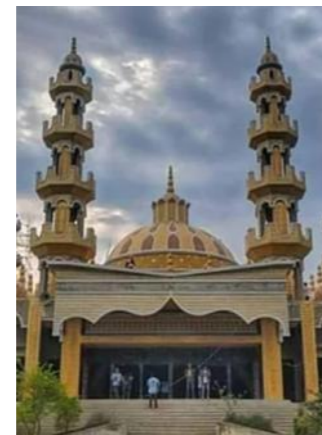
The Dome Mosque