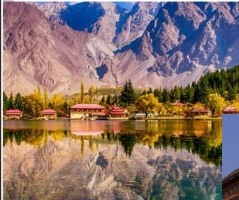
The Himalayan Mountains