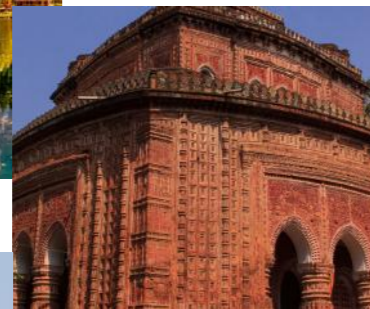
Kantajew Temple; a stunning Hindu temple in Dinajpur