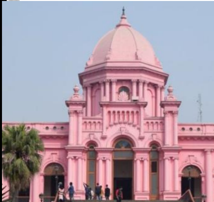
Ahsan Manzil - The Pink Palace

This week, we're going to learn and practise how to say 'Good morning' and 'Goodbye' in Bengali.