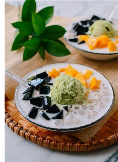
Che thap cam (Grass jelly dessert)