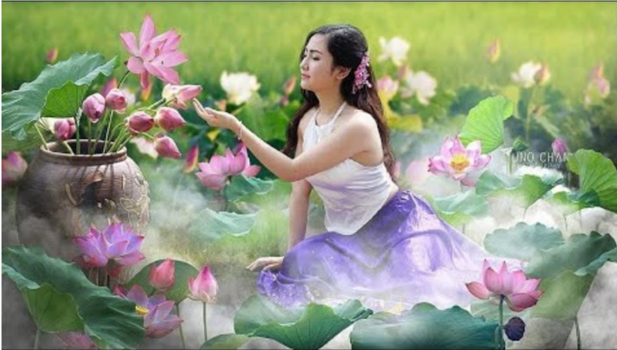
Traditional Vietnamese music