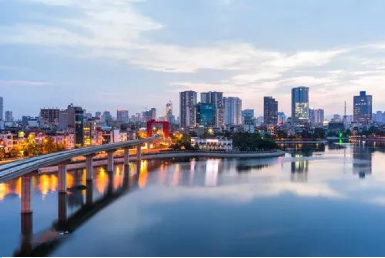
Hanoi - the capital city (5 million inhabitants)