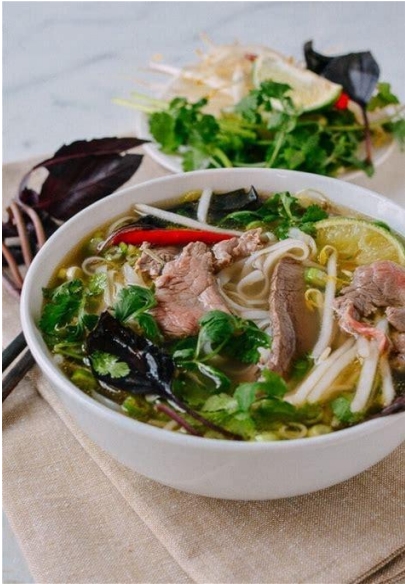
Pho (noodle soup)