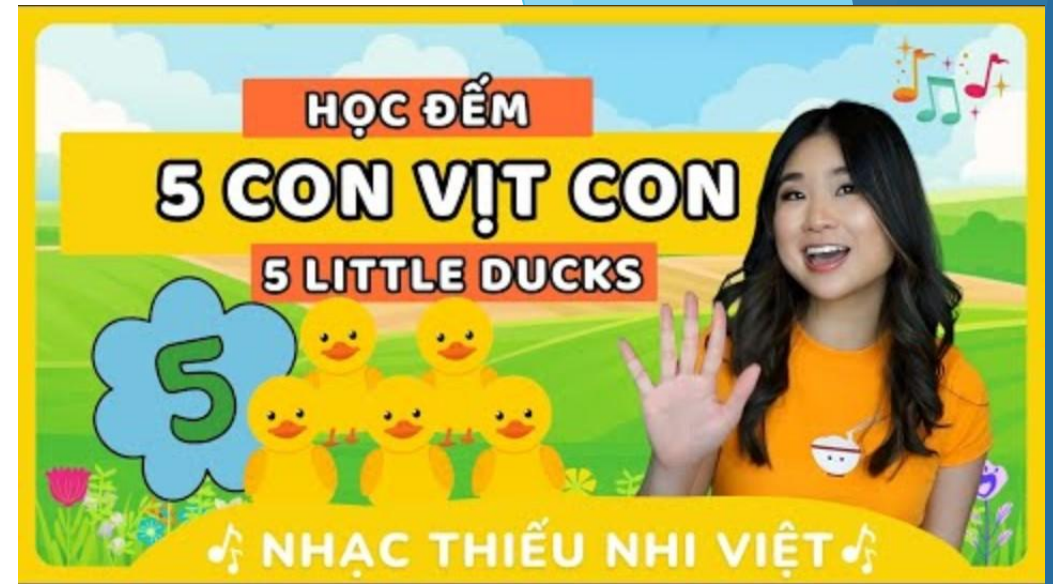
Nursery rhyme in Vietnamese