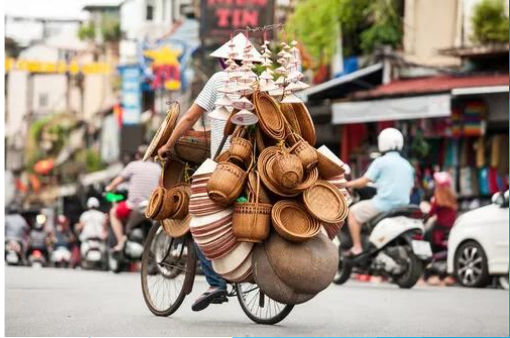
Street vendor in Hanoi